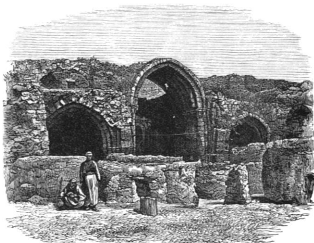
CHURCH OF ST. ANNE, SEPPHORIS.

Illustration from Tent Work in Palestine (My 53)